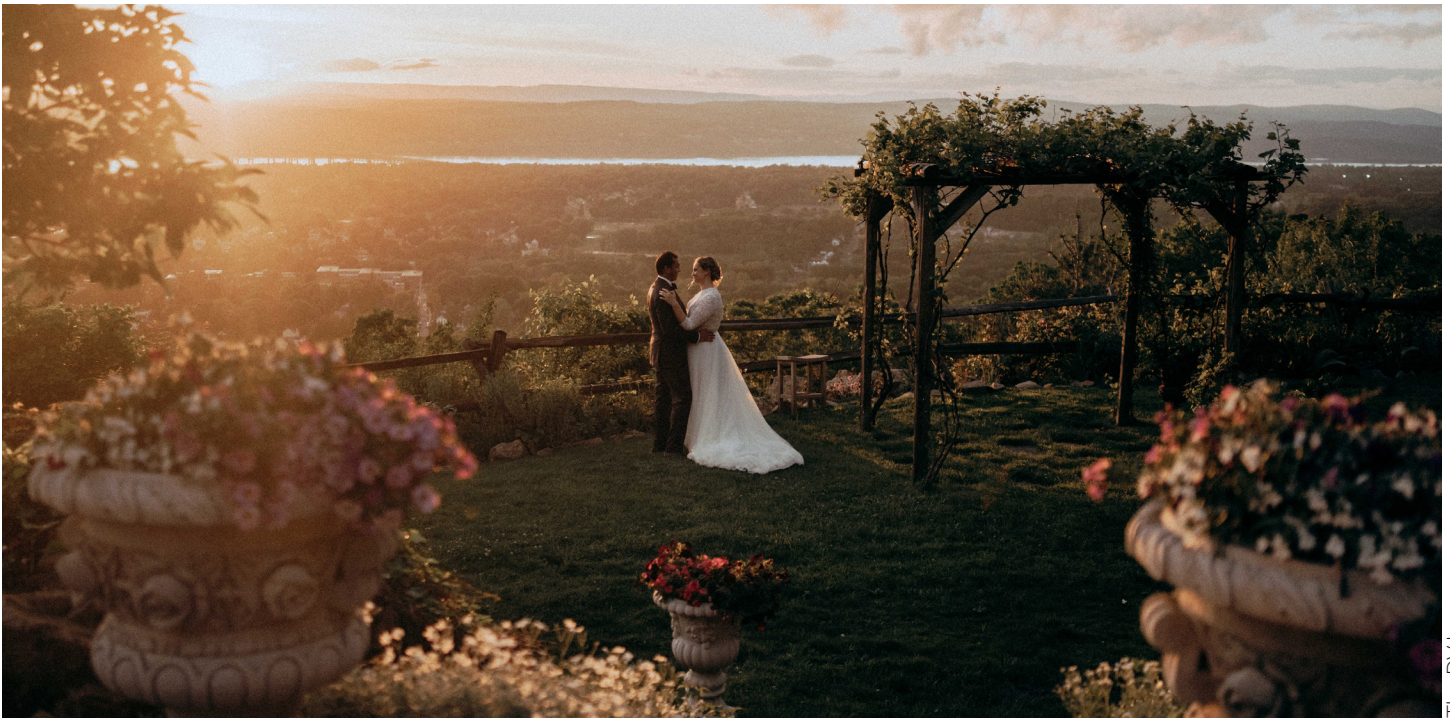
The DV Image