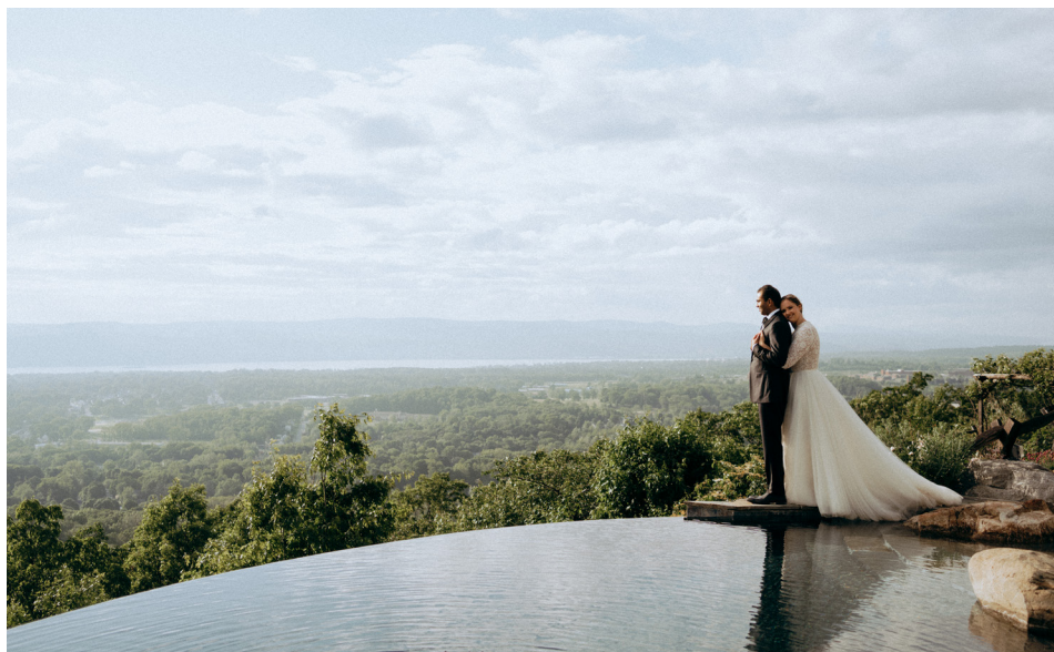
The DV Image