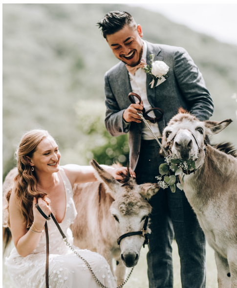
Fox and Hare